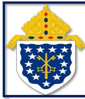
Diocese of St. Thomas in the US Virgin Islands