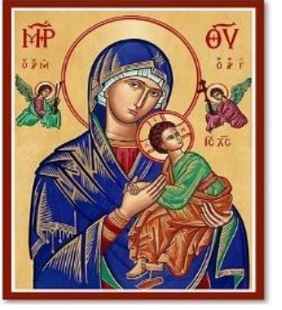
Our Lady of Perpetual Help