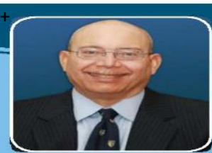
Featured Expert National Public Radio 107.3FM